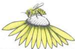
TALATON GARDEN & PRODUCE ASSOCIATION

Hopefully you are still enjoying this seasons crops and flowers in some mellow autumn sunshine and you wet and cold weather we experienced in early September. It is now time to start clearing up your veg plot and planting green manure such as field beans, to help enrich your soil and crowd out weed seedlings. Earth up leeks and celery, to keep them blanched. Finish pruning your blackberries and summer raspberries.