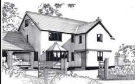
Simon Spencer mciat

Give me a call on 01404 822778 or 07973 653758. I can offer a fast and efficient service tailor made to your needs (with no VAT).