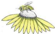
TALATON GARDEN & PRODUCE ASSOCIATION

The old saying that March winds and April showers make way for May's flowers may once have been true, but as I write (April 9 th ) we have some very unwelcome strong and gusty winds whipping around the latest daffodils and tulips. The Spring flowers had been looking lovely up until now. Hopefully they will recover.