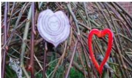
♥ Becky Springall's Art of the frozen red onion and pepper