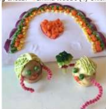
♥ Becca Wheeler's Potato People and Abi's (4) Vegetable rainbow & heart ♥