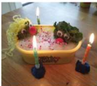
♥ Sarah Wood's Kalettes blissfully soaking in a romantic bubble bath