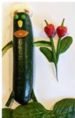
♥ Clare Melbourne's Courgette