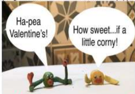
♥ Nish Halwyn's Sweet Happy Valentines ♥