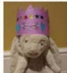
Ernie Wood (5) Blue Bunny

Talaton Community Shop St Valentine's Day Competition Entries 2023 Make a Crown of Hearts