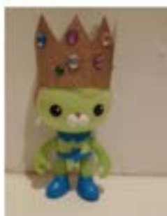
Ben Wood (3) Crowned Oogaboo