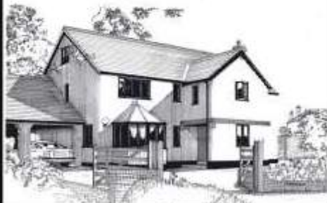
Simon Spencer mciat

Give me a call on 01404 822778 or 07973 653758. I can offer a fast and efficient service tailor made to your needs (with no VAT).