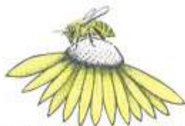
TALATON GARDEN & PRODUCE ASSOCIATION

Many thanks to all who donated such lovely plants to our stall on the 11 th May and to those who helped on the stall. You helped us raise £180 on that gloriously warm sunny morning.