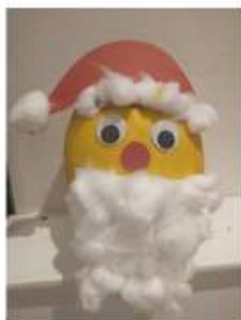
Emma Wood's (4) decorated Melon