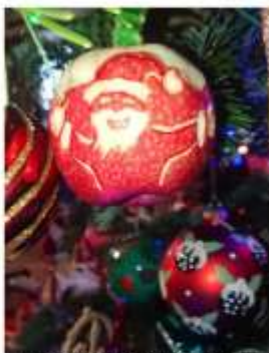
Becky Springall's beautifully carved Father Christmas Apple bauble