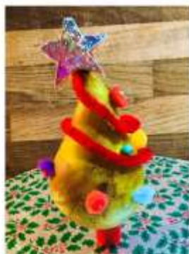
Eira Halwyn's (5) Pear Christmas tree