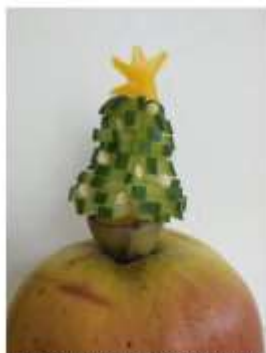
Sarah Wood's intricate Cucumber Christmas tree on a banana base in an apple decorated with pepper seeds and yellow pepper star

Having been asked to send a photo of a festively decorated piece of fruit, Talaton came up with some pretty fruity entries. Such clever talent in Talaton, at such a busy time of year. Thank you YOU ARE ALL TUTTI FRUITI BRILLIANT!