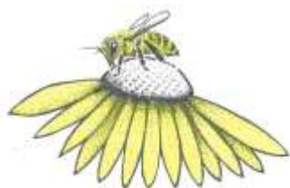
TALATON GARDEN & PRODUCE ASSOCIATION

Well done to the happy band of members who visited an afternoon at Bickham House beautiful gardens and demolished the delicious cream teas. Do tell the other members what they missed!